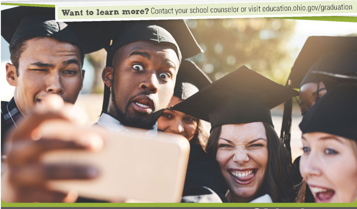
2 | Ohio Graduation Requirements: Classes of 2023 and Beyond | August 2019 |